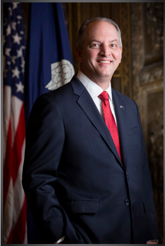
John Bel Edwards